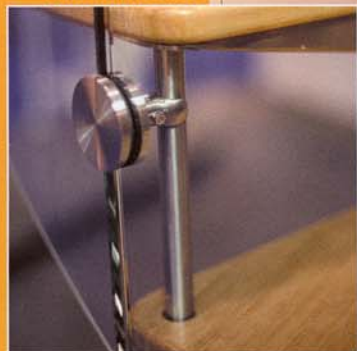
Model: Enfold Glass

The Enzie system provides safe, aesthetically pleasing stairs that are easily installed and quality manufacture assures you of long-term value